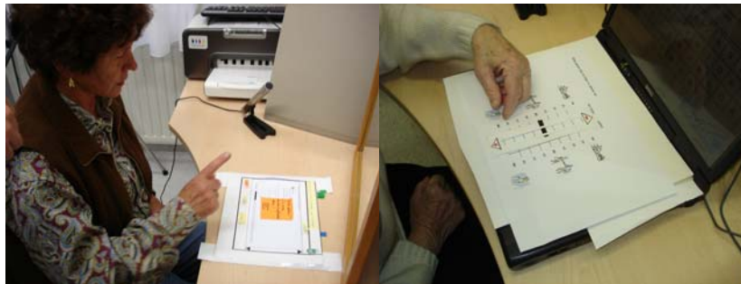
Figure 2 (left): One of our elderly patients is operating the paper mock-up Figure 3 (right): Various input possibilities have been tested on paper

The term paper mock-up means “to prototype the screen designs and dialogue elements on paper” [13], [14], [9]. It again proved itself an easy and efficient method. With standard office supplies, each interface element (e.g. dialog boxes, menus, error messages, sliders (see figure 3)) has been sketched. This led to an easy creation of alternatives since it encouraged more suggestions due to the ease of alteration. We performed studies at this level with N=10 different people (see e.g. figure 2), the experiments were continued until no further findings were to be gained.