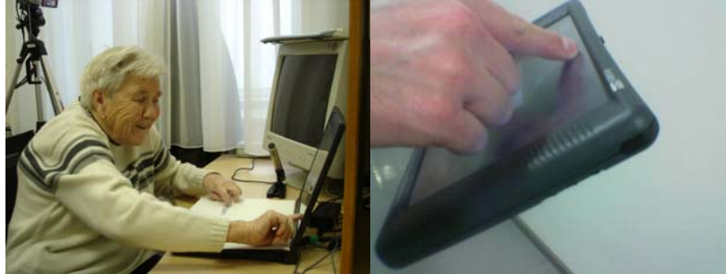
Figure 4 (left): An elderly patient is operating a Hi-Fi Prototype with full functionality