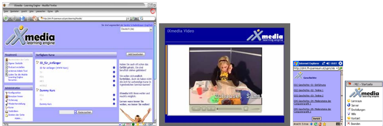
Figure 2: From left to right: Examples on Moodle, TV, PDA and Mobile phone

After registration in Moodle, the end-users receive all relevant access information and are able to choose between different courses. After downloading the software required for different end-devices the end-users are able to use the content on the selected end-devices. It is also possible to inform users about news via E-mail or RSS-Feeds. Of course, the use of other standard modules, which are included in Moodle, including chat, forum, glossary, tests, Wiki and workshops, is possible. The application is also compliant with SCORM (Holzinger, 2002).